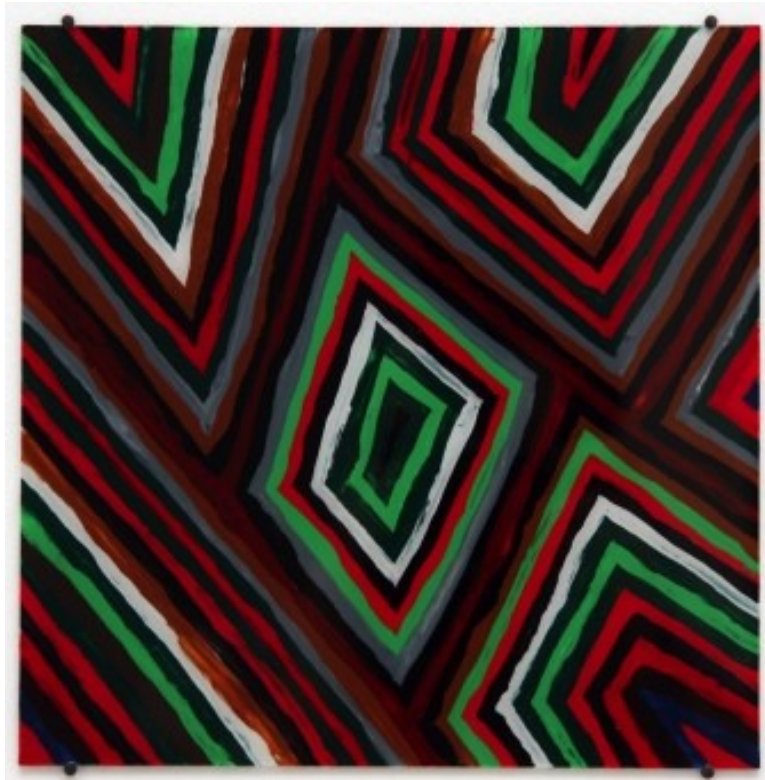
Untitled 2009 reversed glass painting 25x25 cm