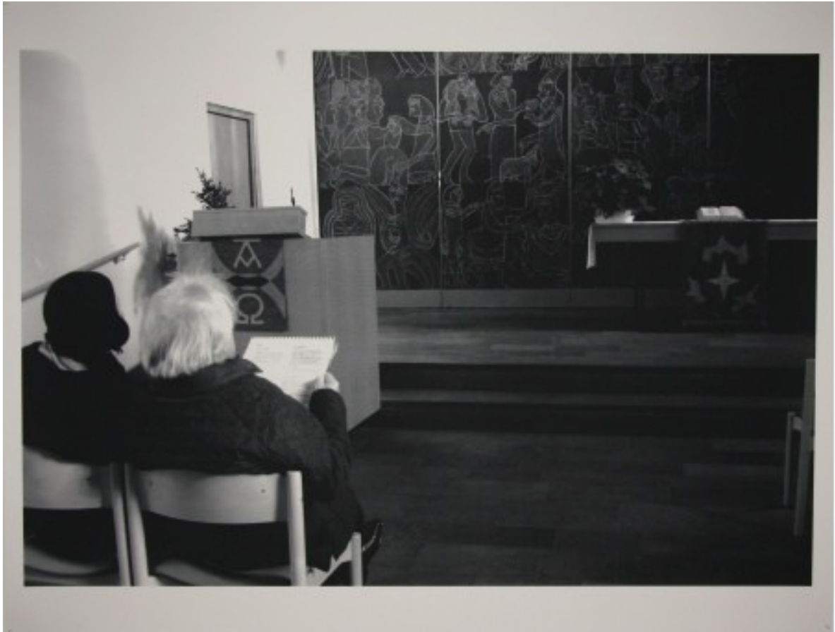
Father / Sister in Church 2008 silk screen print 120x160 cm