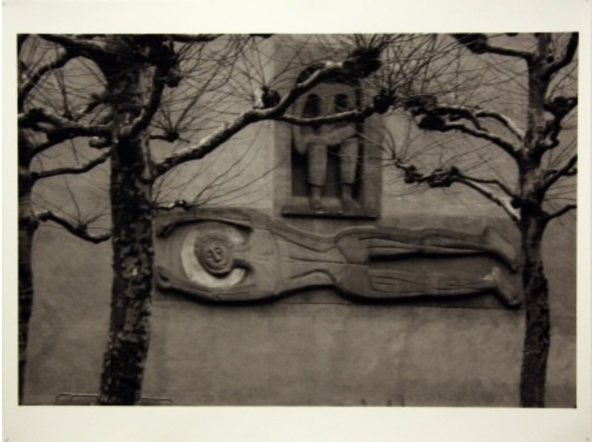
Floating Figure 2008 silk screen print 120x160 cm