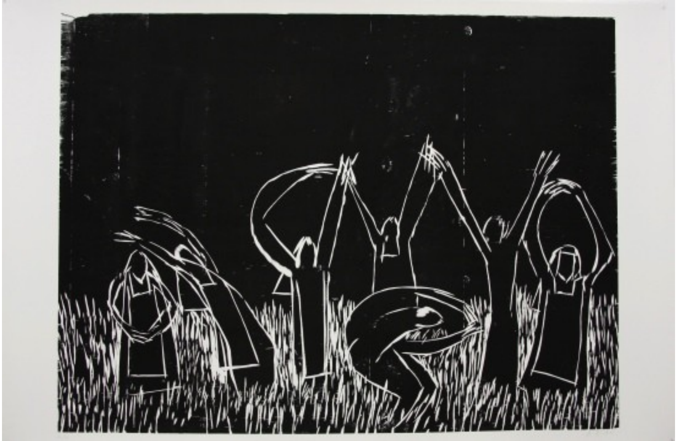
Dancing Nuns 2007 woodcut 120x180 cm